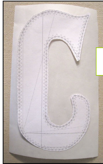
Cut piece of fusible backing